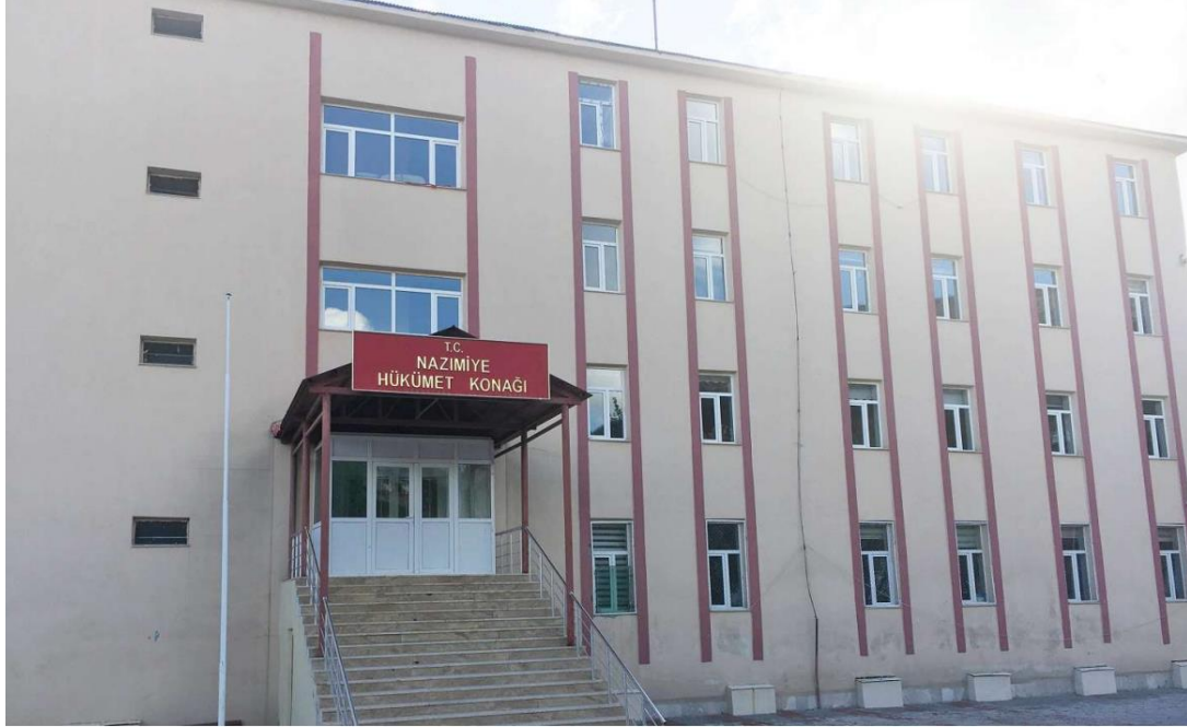
Figure 5 - Nazimiye Government House General View - 1