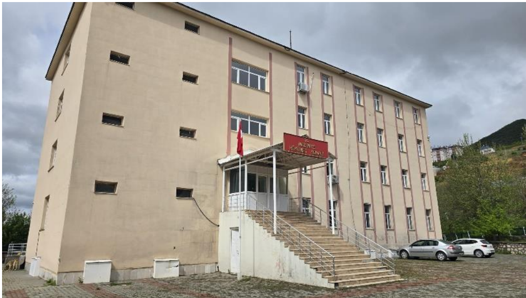
Figure 6 - Nazimiye Government House General View - 2