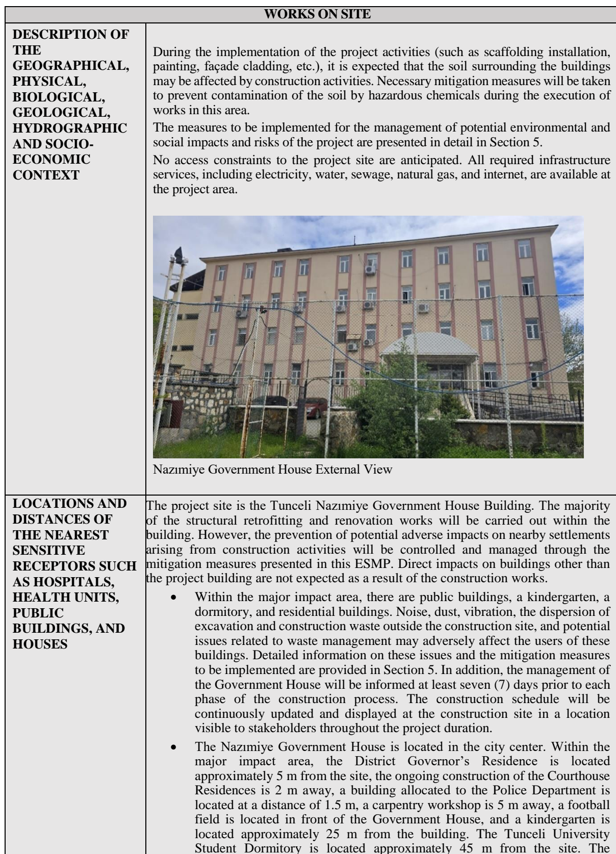
Table 3 - Summary Information on the Activities to be Carried Out