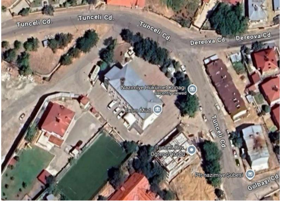
Figure 2 - Nazımiye Government House Satellite View