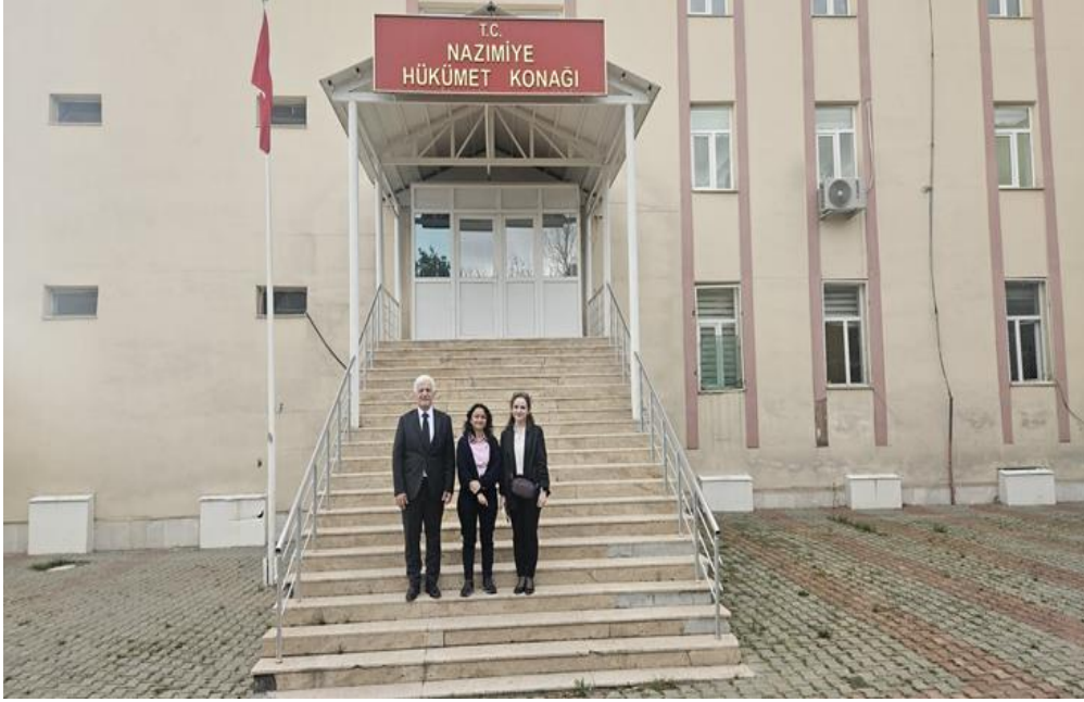
Figure 7 - Nazimiye Government House General View - 3