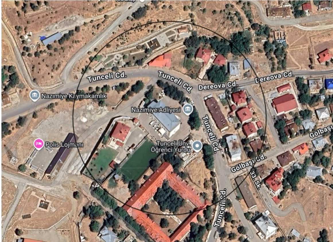
Figure 4 - Nazımiye Government House Major Impact Zone

Any potential adverse impacts that may arise during the structural retrofitting and renovation works at the Government House are expected to primarily occur within the building. As no ground improvement works are required, the limited external impacts—including noise and dust generation, increased traffic, vibration, and visual impacts—are expected to remain confined to the immediate surroundings. The area potentially affected by these impacts is limited to a radius of 100 meters, and the major impact zone is illustrated in Figure 4.