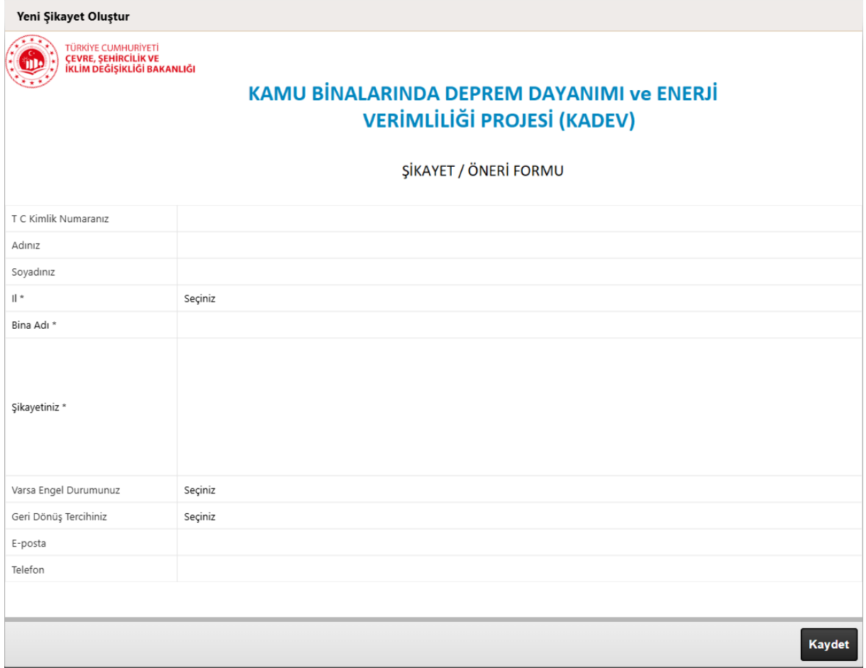
Figure 9 - Suggestion & Grievance Form

The visual of the online form accessible at https://kadevoneri.csb.gov.tr/oneri.jsp is provided below.