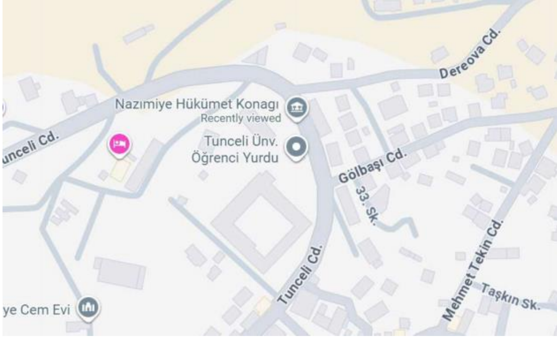
Figure 1 - Nazımiye Government House Location

The information regarding the buildings within the scope of the sub-project is provided in Table 1.