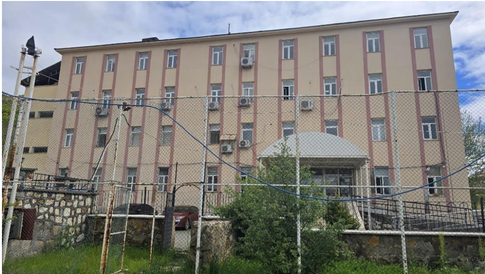
Figure 8 - Nazimiye Government House General View - 4