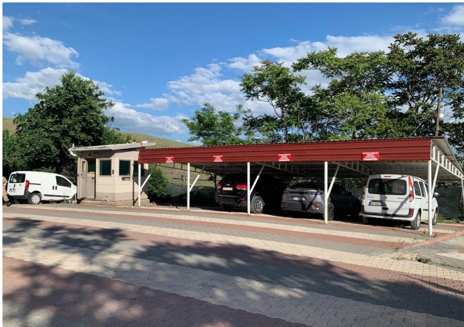
Figure 8 - Mazgirt Government House Backyard