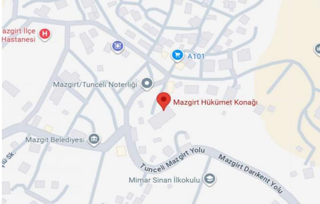
Figure 1 - Location of the Mazgirt Government House

The information regarding the buildings within the scope of the sub-project is provided in Table 1.