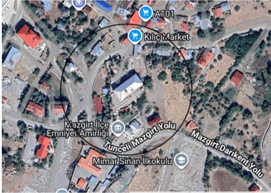
Figure 4 - Major Impact Zone

Within the major impact zone, defined by a 100-meter radius, several structures are located, including district headquarters of political parties (40 m), shops and residential units (20 m), 124 vacant containers (20 m), the police building and courthouse lodging (15 m), the gendarmerie building (45 m), and Ziraat Bank (50 m). In addition, the District Governor's residence is situated only 2 meters in front of the building.