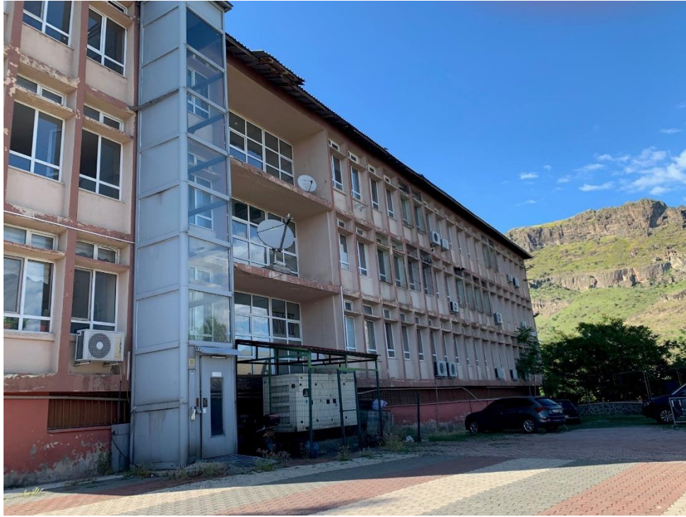
Figure 7 - Mazgirt Government House Back View