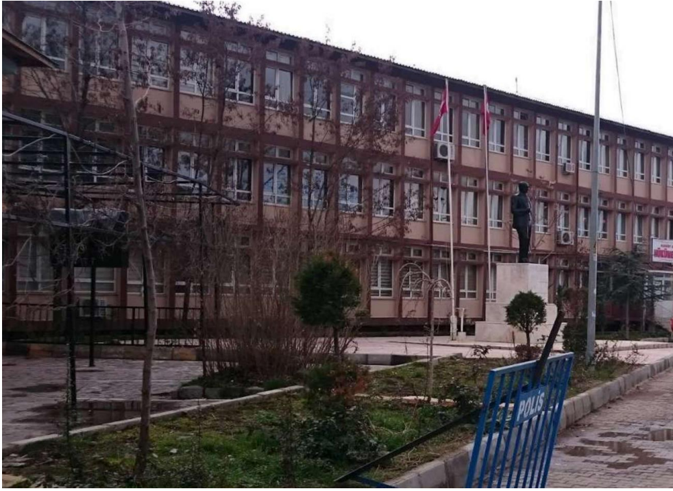
Figure 5 - Mazgirt Government House General View