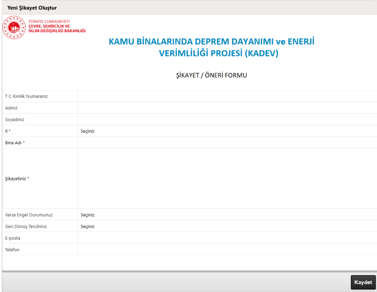
Figure7 Suggestion & Grievance Form

The visual of the online form accessible at https://kadevoneri.csb.gov.tr/oneri.jsp is provided below.