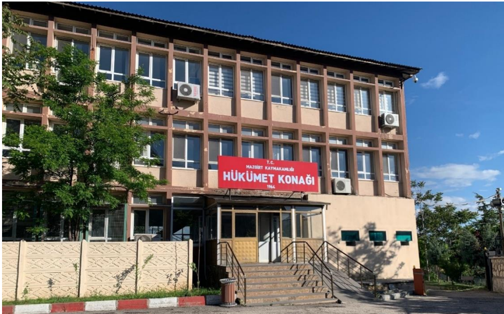
Figure 6 - Mazgirt Government House General View / 2