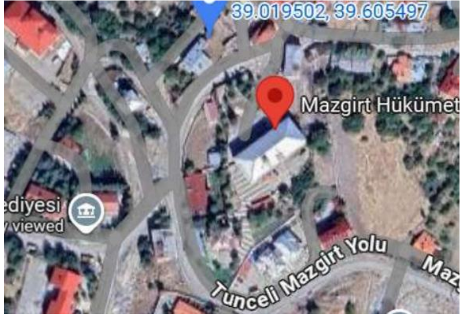
Figure 2 - Mazgirt Government House Building Satellite View