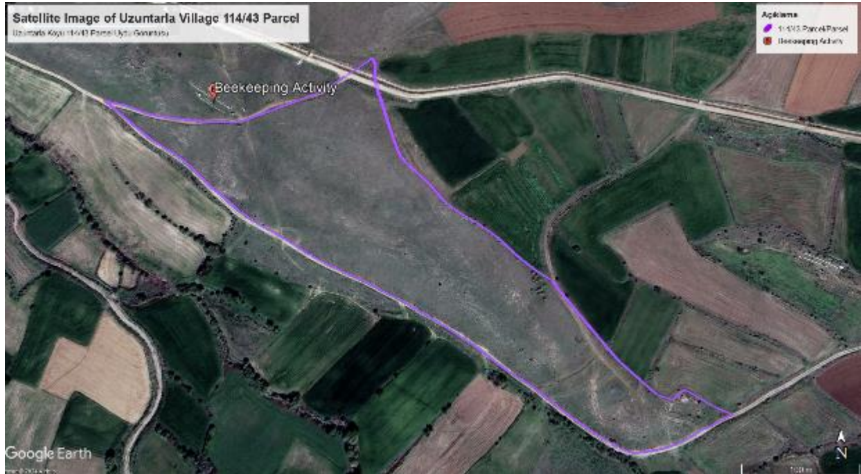
Figure 4. Satellite Image of the 114/43 Parcel in Uzuntarla Village