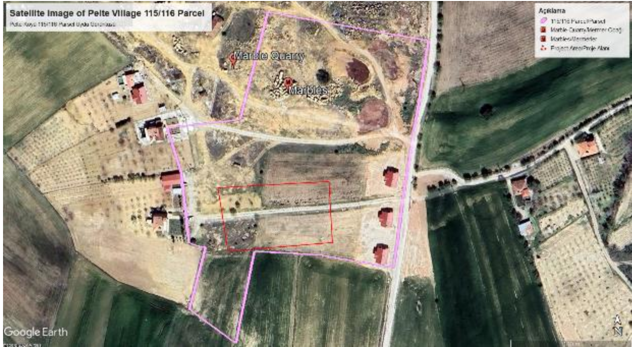
Figure 1. Satellite Image of 115/116 Parcel Area in Pelte Village

the distances to the close dwellings and other facilities and features are given in Table 2.