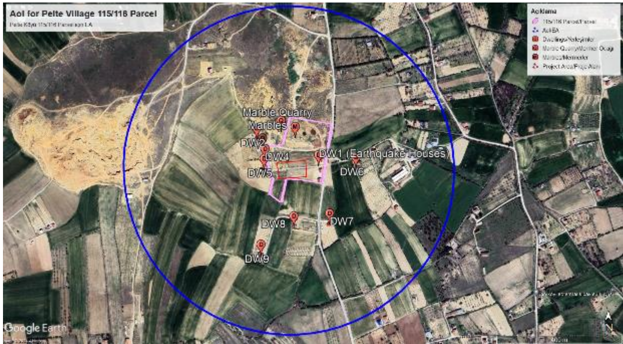
Figure 2. Satellite Image of the 115/116 Parcel Area in Pelte Village (From near)