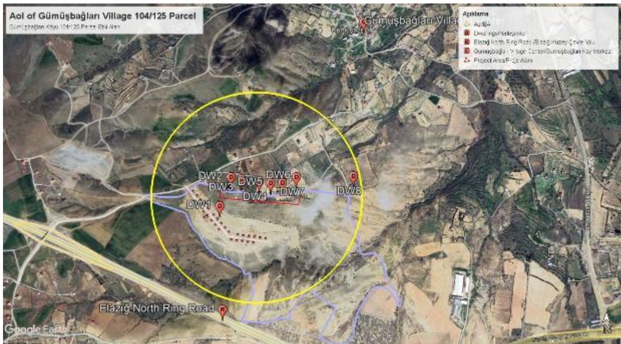
Figure 7. Area of Influence in the Village of Gümüşbağlar