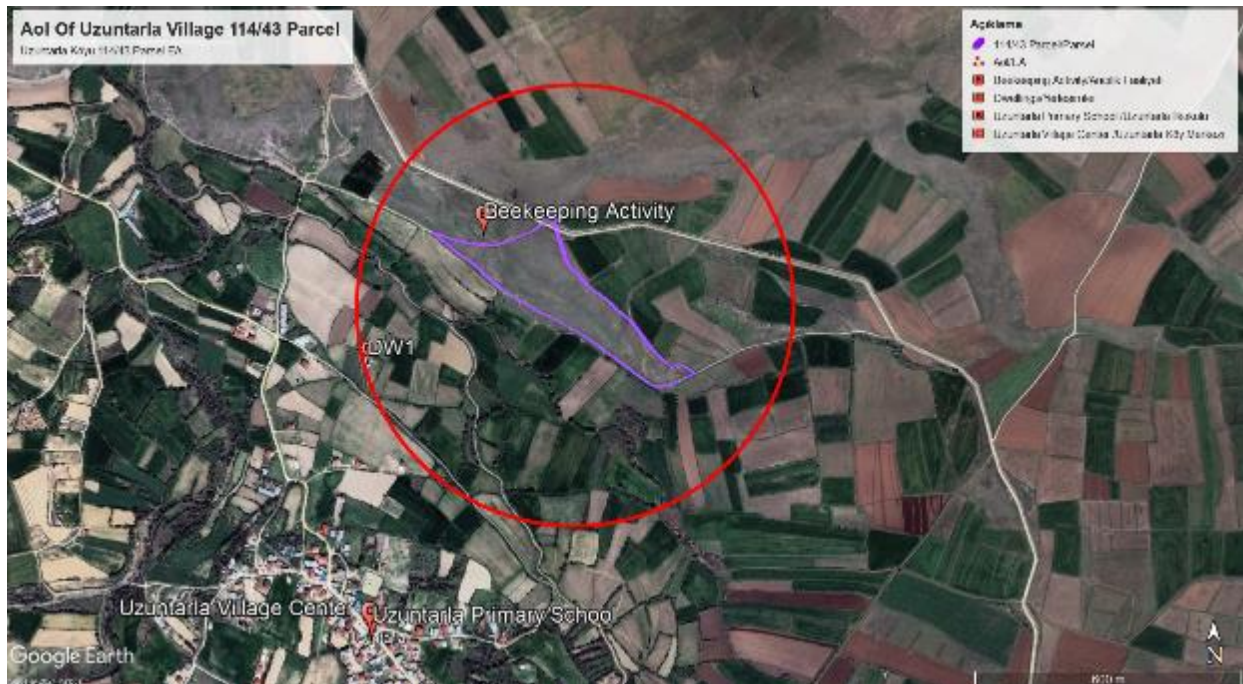
Figure 5. Area of Influence in the Village of Uzuntarla