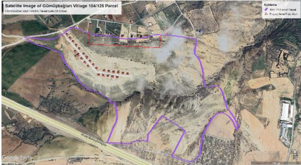
Figure 6. Satellite Image of 104/125 Parcel in Gümüşbağlar Village

The AoI of the selected parcel and close dwellings and other facilities and features are shown in the following figure (see Figure 77), and distances are given in Table 4.