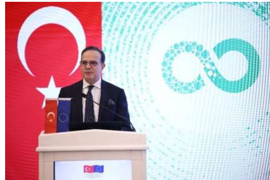
Circular Economy Conference, Ankara