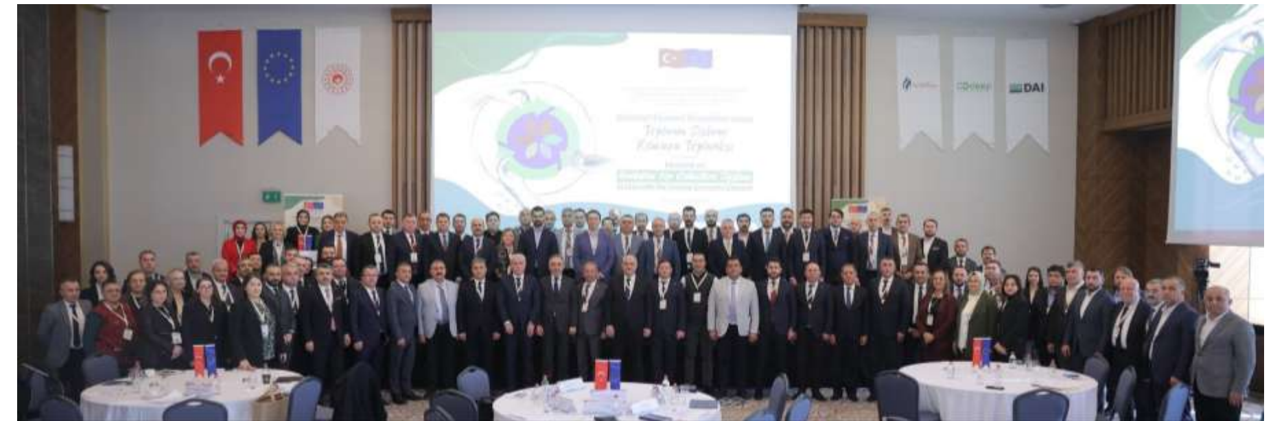
High Level Meeting for Alternative Collection Models, Ankara