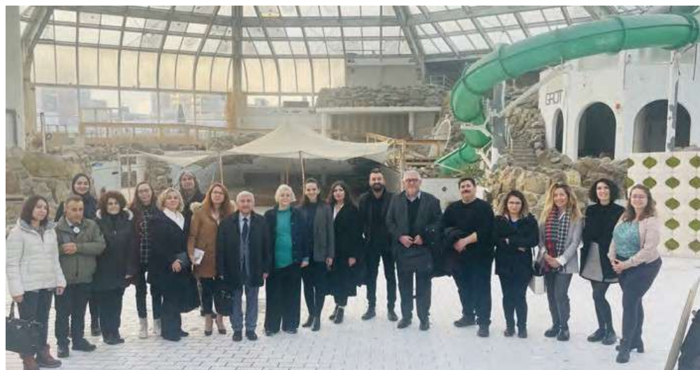
Good Practices, Amsterdam