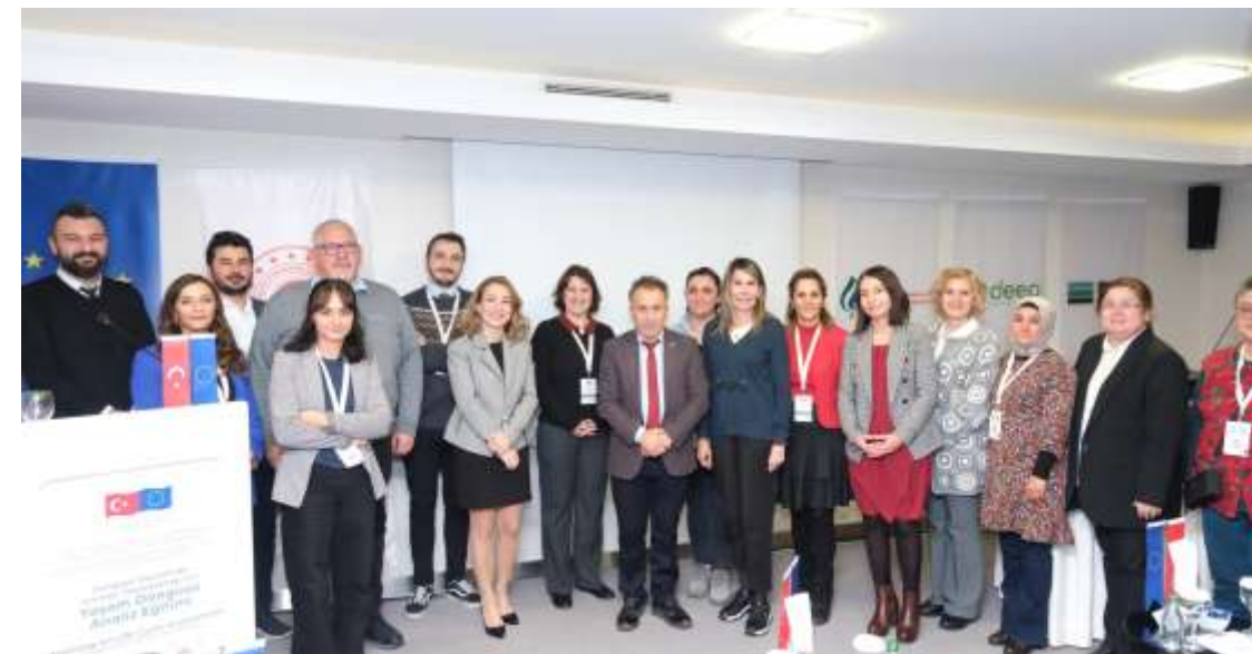
Life Cycle Assessment Training, Ankara