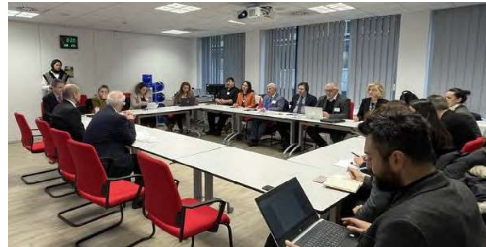
European Commission, Brussels

A total of 31 representatives from the MoEUCC and relevant stakeholders increased their knowledge capacity through 4 study visits on recent developments on EU circular economy policies (Belgium), monitoring circular economy (Luxembourg and France) and good practices in Member States (the Netherlands, Spain and Germany).