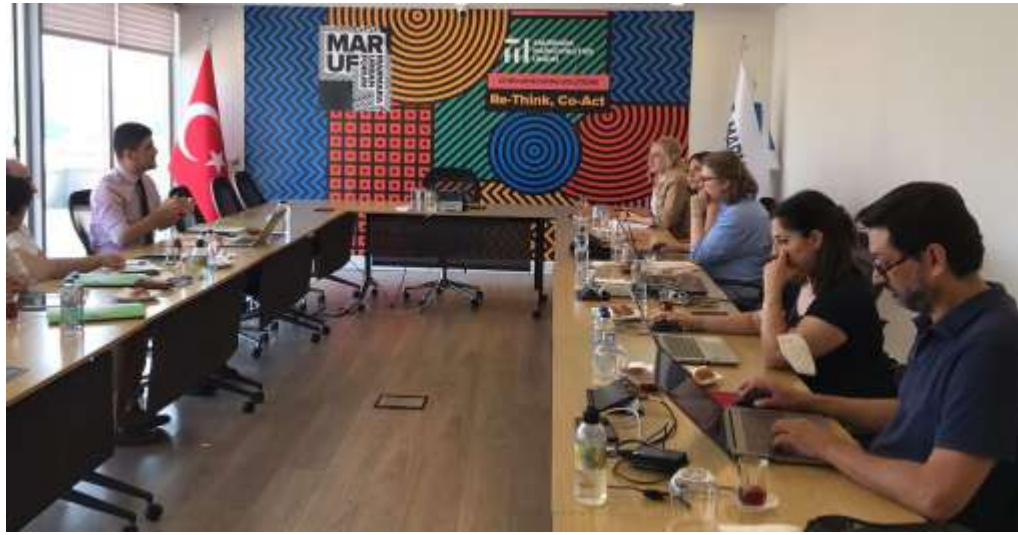
Marmara Municipalities Union, İstanbul

Information exchange on project activities and EU circular economy policies and initiatives was carried out through bilateral meetings with more than 140 institutions and more than 4000 questionnaires applied.