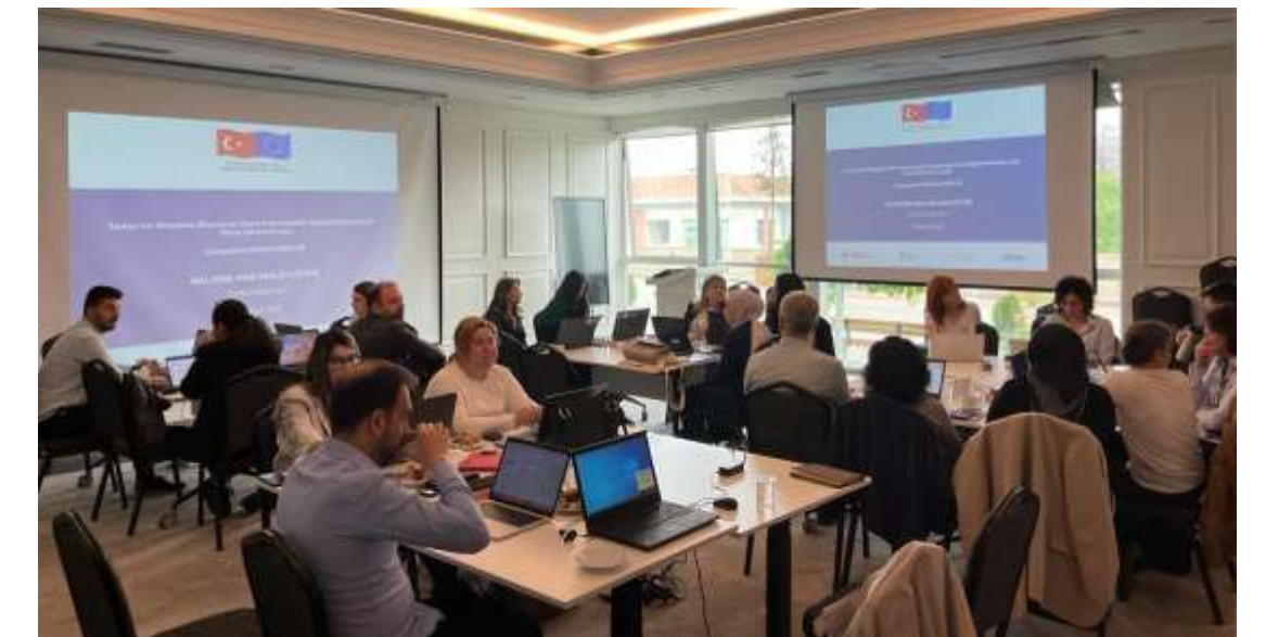
Material Flow Accounting Training, Ankara