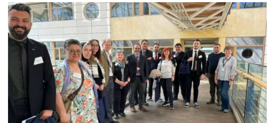
Circular Economy Indicators, Luxembourg