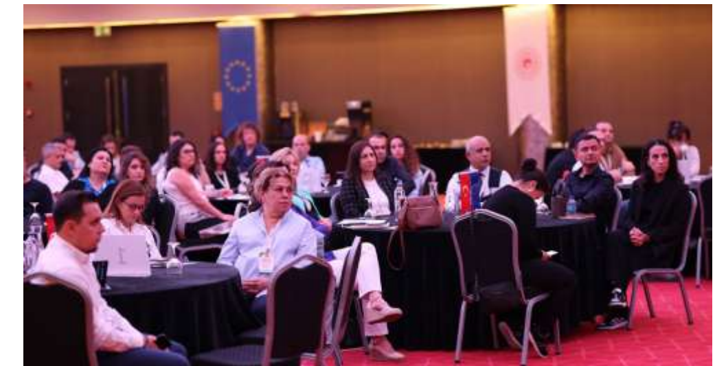
Zero Waste Management System Workshop, Antalya