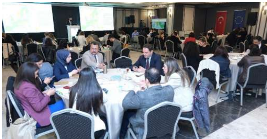
Strategy Development Workshops, Ankara

Key outputs were developed with the participation of 996 representatives from public institutions, academia, private sector and the NGOs in 10 workshops.