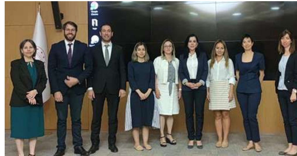
Ministry of Energy and Natural Resources, Ankara