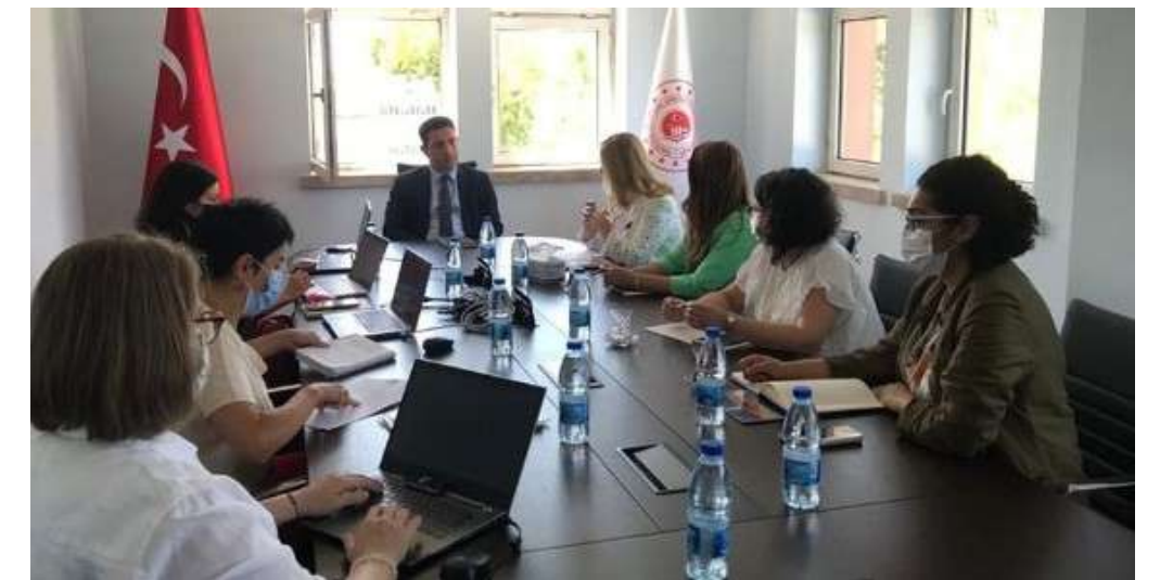
Directorate of Climate Change, Ankara