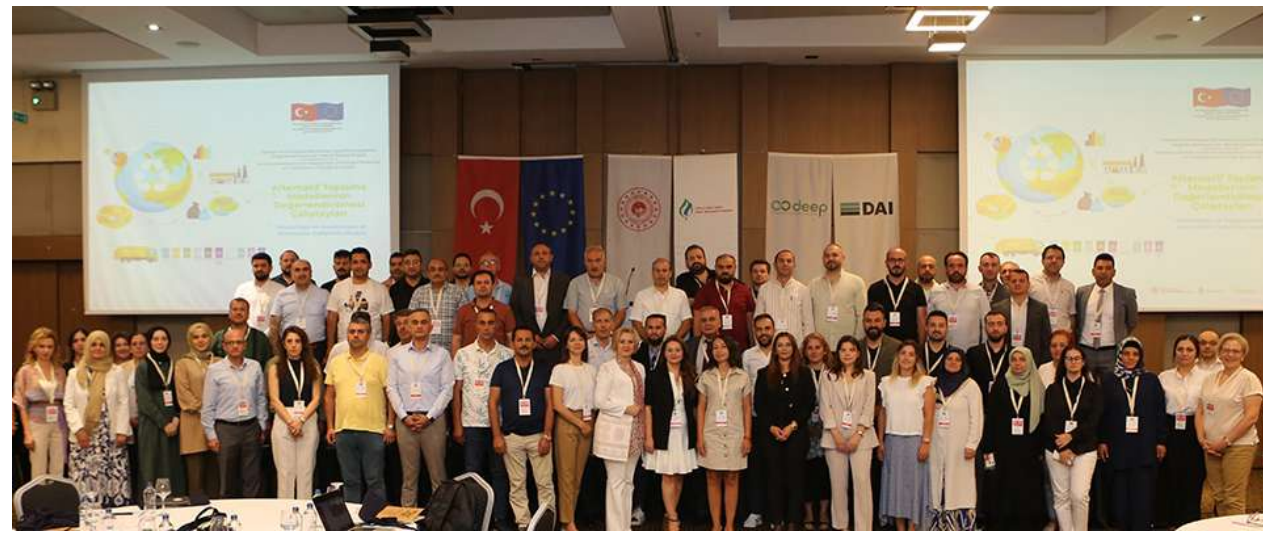
Workshops on Assessment of Alternative Collection Models, Gaziantep, Samsun, Konya