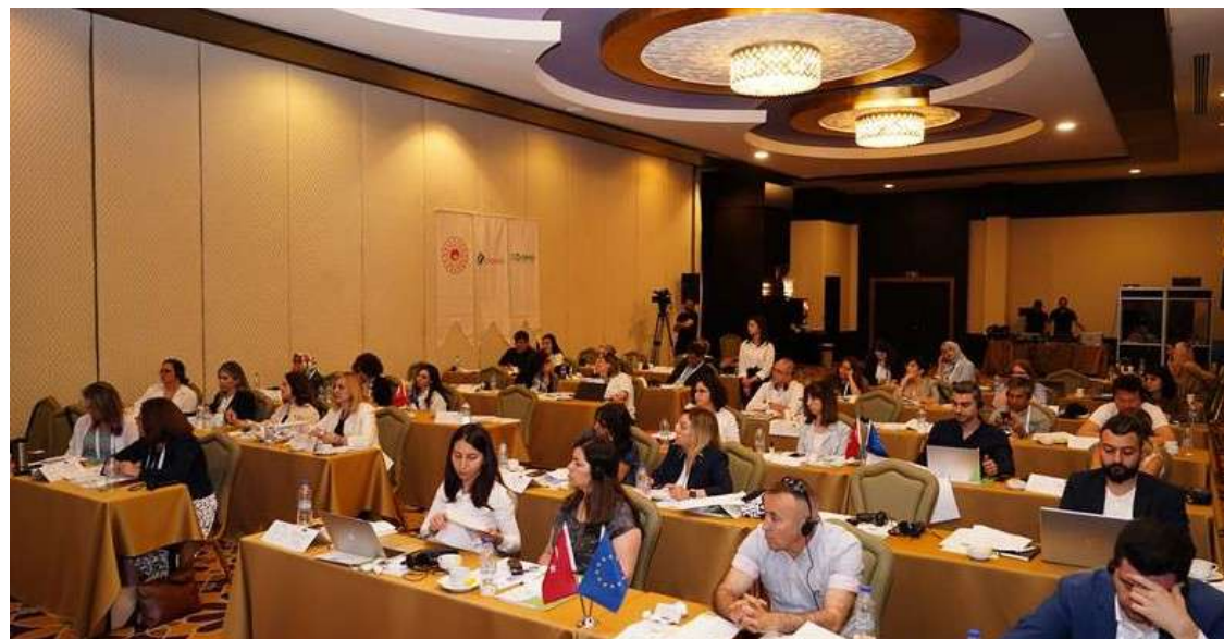
Circular Economy Training, Antalya