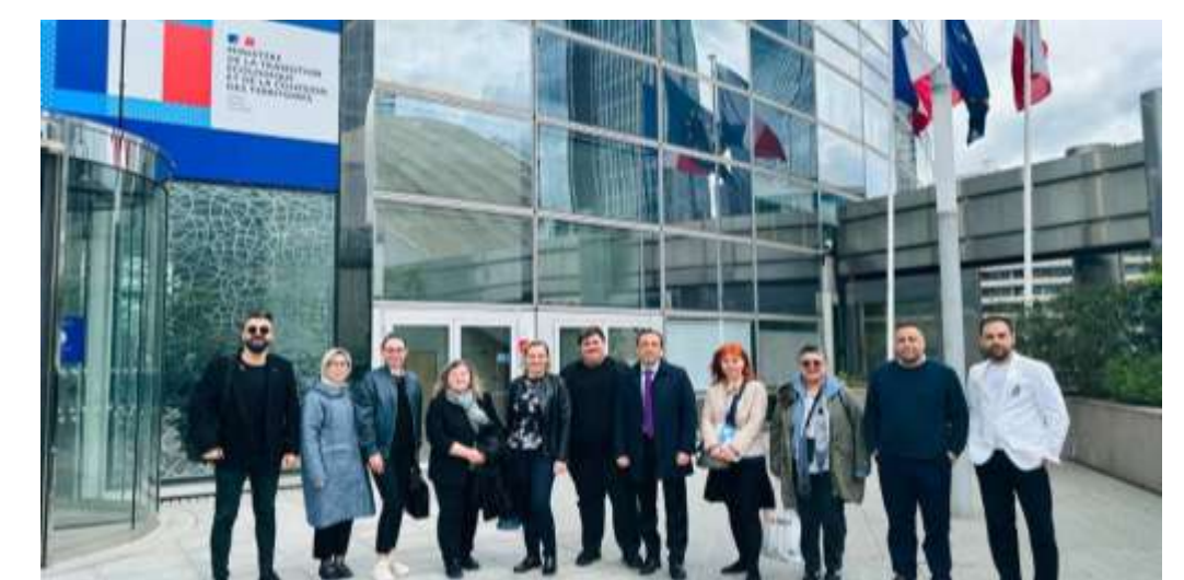
Circular Economy Indicators, Paris