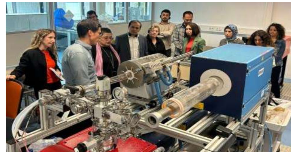
Good Practices, Munich