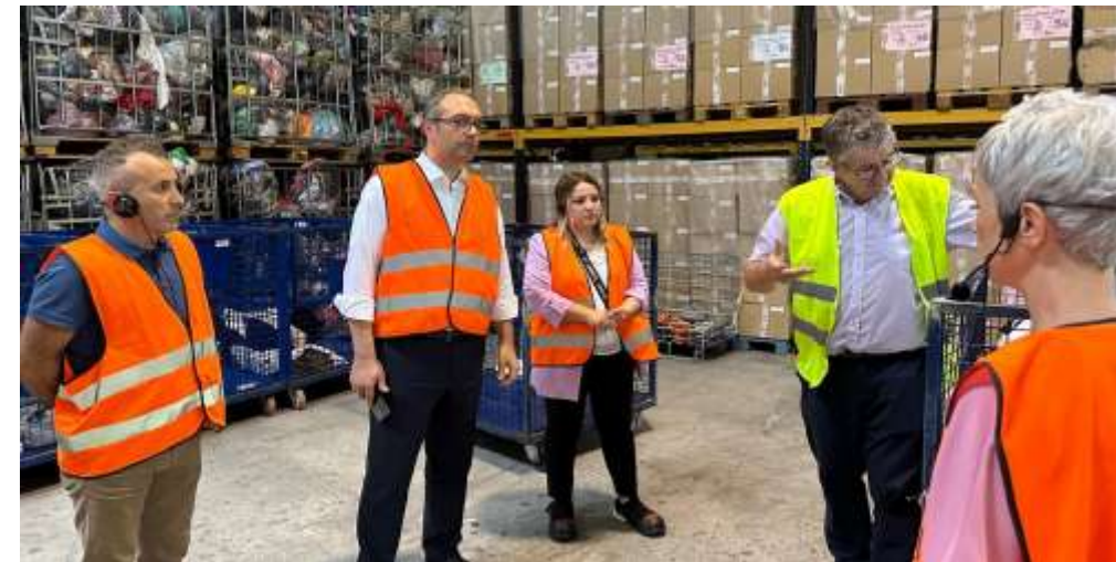
Good Practices, Barcelona