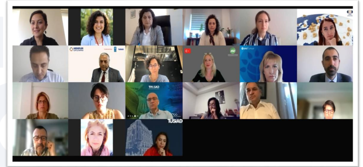
Green and Circular Economy Working Group Meeting II, 07.09.2021.