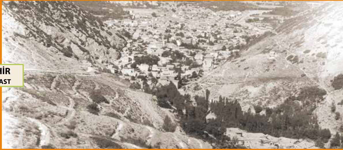
AKŞEHİR IN THE PAST

Hand to hand for a more green and liveable world