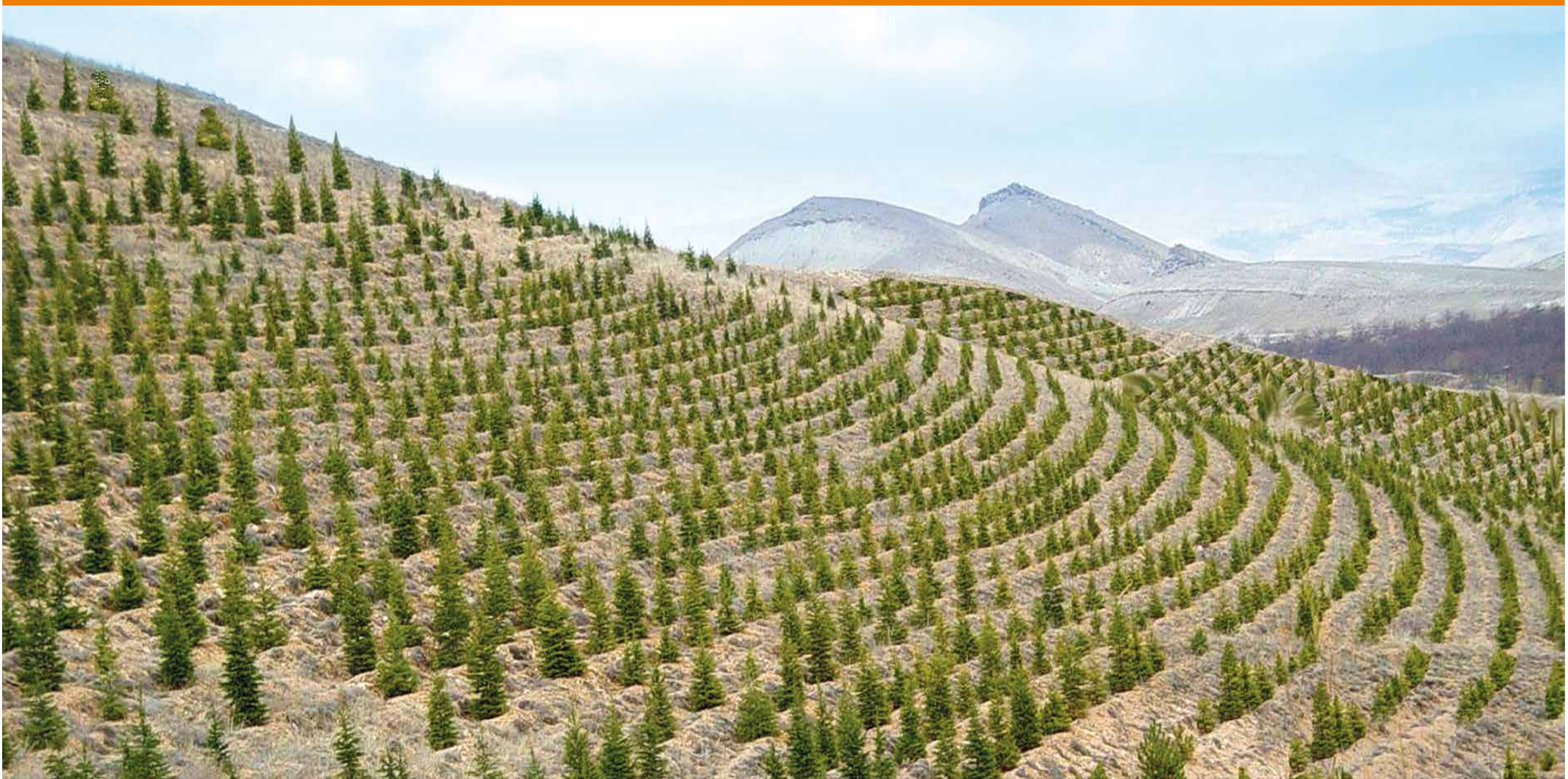
Forest assets of Turkey over the years