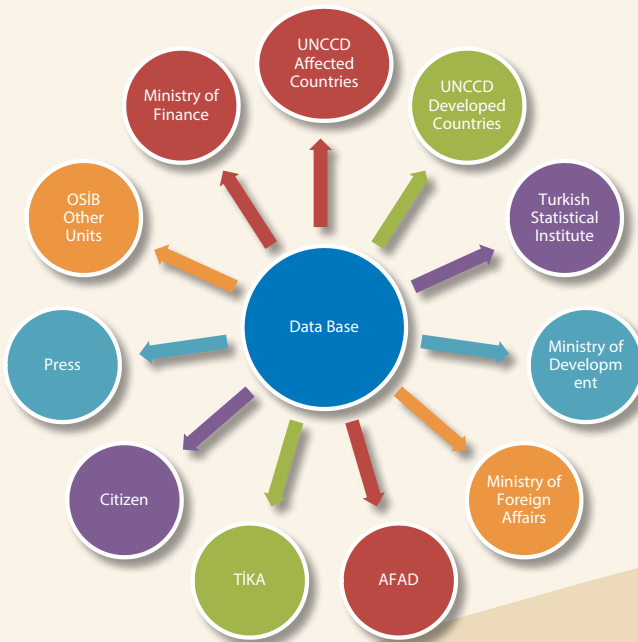
Figure 2: Institutions to benefit from Monitoring, Assessment and Reporting System