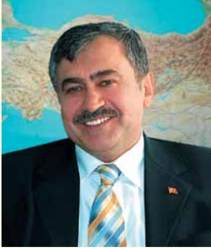
Prof. Dr. Veysel EROĞLU Minister of Forestry and Water Affairs

The “Turkish-African Collaboration Summit” held in Istanbul in 2008 has been a turning point in the Turkish-African relations and this was followed by the issuing of the 2010/7 numbered Prime Ministerial Notice on “African Strategy” and an “African Strategy Co-ordination Committee” has been established in coordination with the Ministry of Foreign Affairs. Our Ministry is one of the members of this committee. Under the scope of African Strategy, our Ministry has already started works on combating desertification and drought, forestry and water supply.